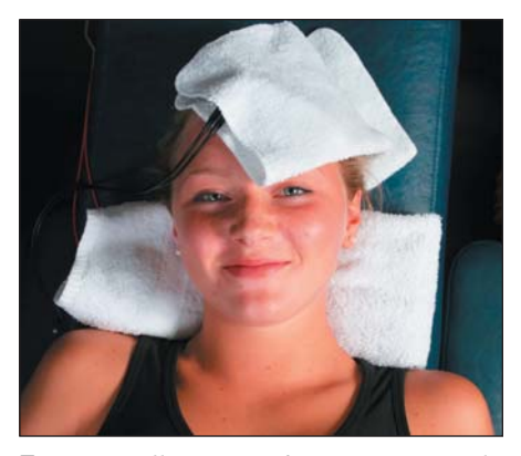
FIGURE 2. Illustration of treatment setup: the two positive contacts for both channels are applied to the upper back and the two negative contacts for both channels are applied to the top of the head along the distribution of the affected nerve.

The osteopath's method of treatment included using a frequency on one channel to "remove a pathology" combined with a frequency on the second channel to "address a specific tissue." The device used by the osteopath has long since disappeared and has never been available for inspection. While it is thought to have plugged into the wall current which may have been DC in 1922, it is not known what current level it delivered and there is no reason to suspect that it delivered microamperage current which was not introduced until the 1970s. The listed frequencies were used, starting in 1995, as if their descriptions were correct for the treatment of myofascial trigger points, nerve pain and injury repair. The treatment protocols were developed clinically using the osteopath's two-channel condition and tissue treatment paradigm and has been taught as Frequency Specific Microcurrent (FSM) since 1997.<sup>1,2,4,5</sup> There are approximately 1,000 medical, chiropractic and naturo-