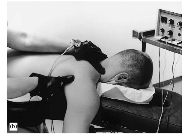
Figure 1 (a). Photograph of microcurrent treatment of low back. The patient may be treated prone or supine. The graphite glove with the positive leads is wrapped in a warm wet towel around the neck. The glove with negative leads is wrapped around the feet. The patient is covered with a blanket to retain body heat during treatment. (b). Prone cervical myofascial paraspinal treatment. (With permission. Chaitow et al., 2003)